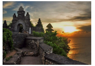
Pura Luhur Uluwatu